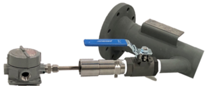
T5 Transducer with FI Insertion Mechanism